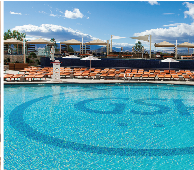
Photos: Crystal Lounge; Full Service Spa & Fitness Center; and, Year-Round Resort Size Pool