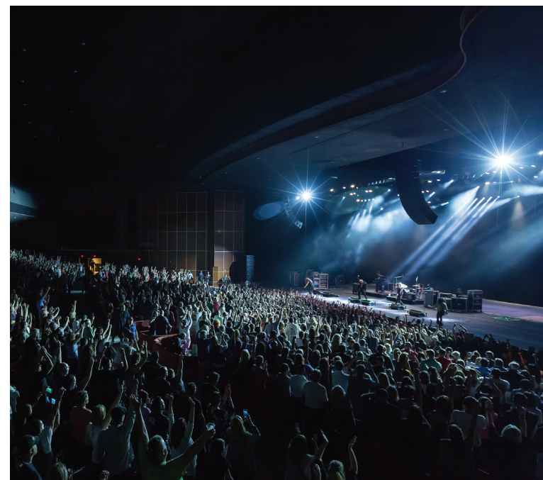
Photos: 85,000 sq ft Casino; Charlie Palmer Steak on Restaurant Row; and, 2,500+ Capacity Grand Theatre